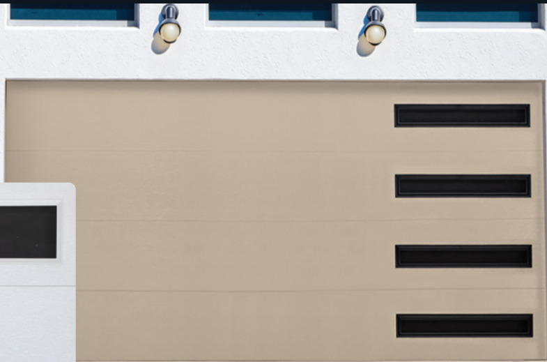
SANDSTONE - CONTEMPORARY WINDOW