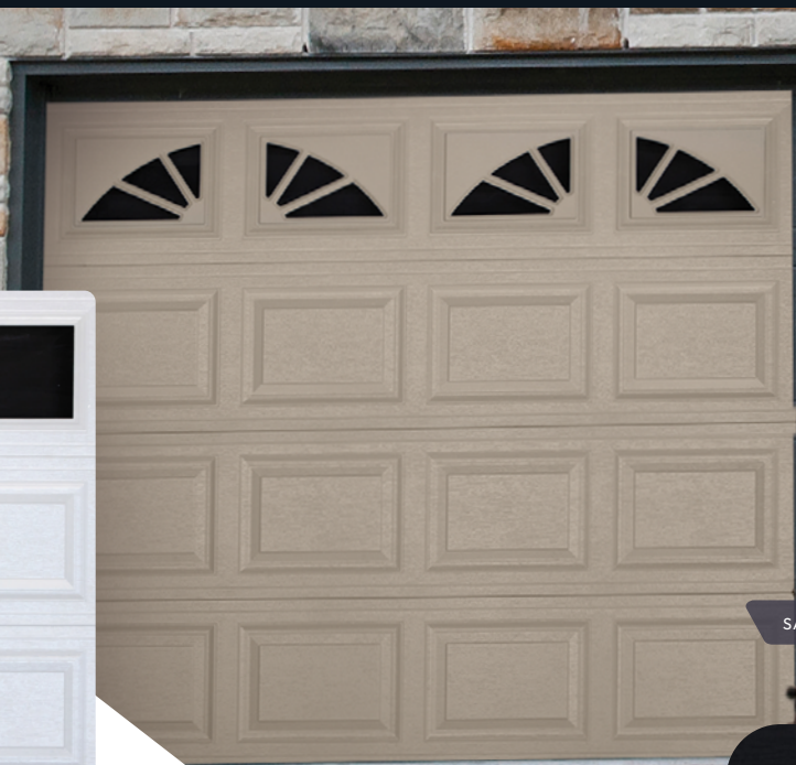
SANDSTONE - SHERWOOD WINDOW