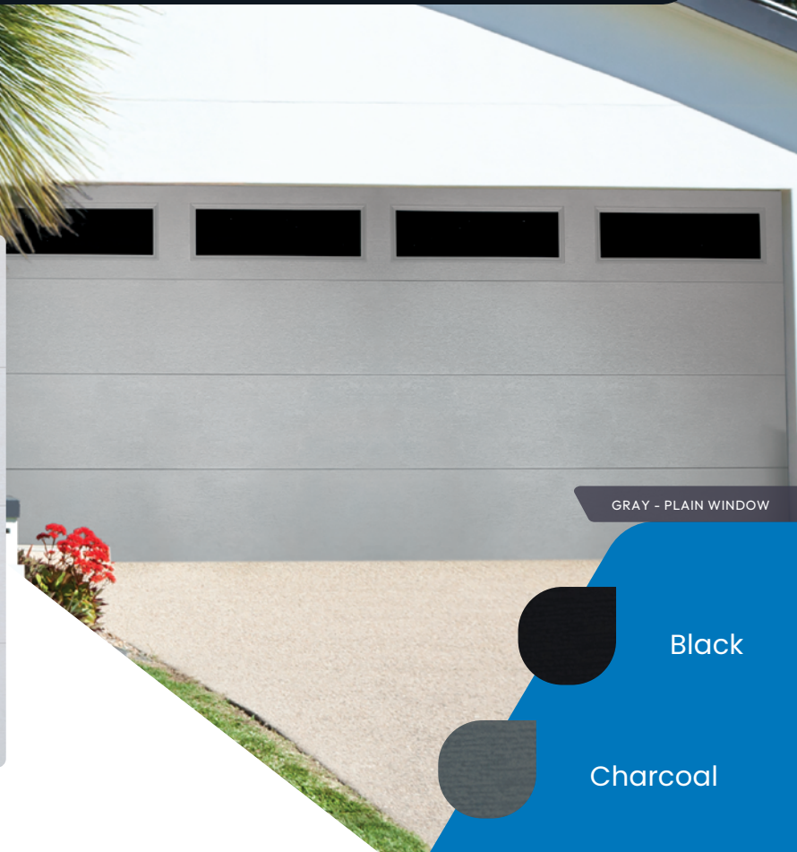
GRAY - PLAIN WINDOW