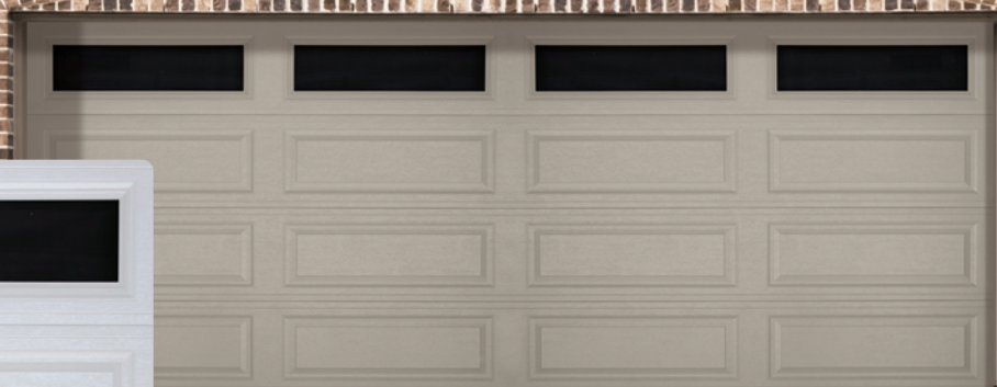
SANDSTONE - PLAIN WINDOW